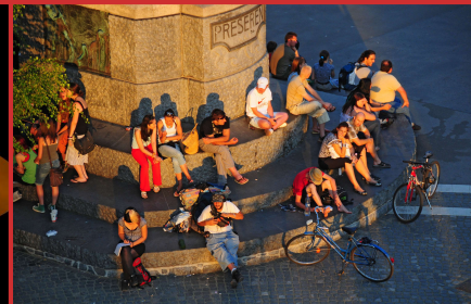
sundown at Prešeren Square