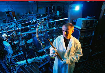
X-ray spectroscopy of a Roman sword

nuclear engineering meteorology and geophysics medical physics physics education mathematical and computational physics biophysics soft condensed matter